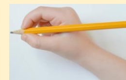
Tripod pencil grip

We will be working on pencil grip, ensuring correct formation of letters in our name and giving meaning to our marks and symbols.