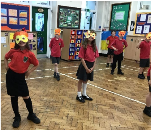
Year 2 performing their Lion King dance in masks

This week has also been our yearly Arts Week in school, with each class looking at a different element of the arts (art, music and drama) around the theme of 'Stories'. The children have had a fun time in their classes experiencing new techniques and different activities. Here are just a couple of pictures just to give a flavour: