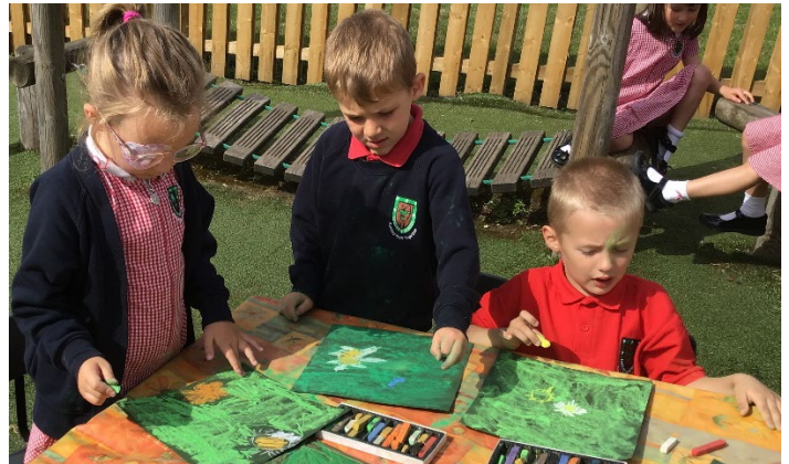
Reception with their outdoor nature artwork